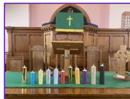
We enjoyed telling everyone the Lord's Prayer using candles

We are incredibly lucky to still have children worshipping with us on a Sunday morning and we are thankful to have such faithful, dedicated leaders. Nine children join us, and they are cheerful, kind, funny and share such happiness with us. But, above all, they are so enthusiastic to learn more about Jesus and God. Jigsaw held their Appreciation Service on Sunday 16 th June. Jigsaw is back on Sunday 18 th August,