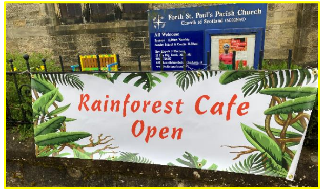
Our new banner