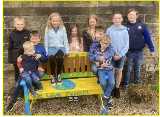
Here is Jigsaw enjoying a rest...

You may have noticed our new summer seat in the Church garden. This was kindly provided by the Co-op and decorated by the children from Forth Primary School. It is for anyone to use. Thank you to everyone who was involved.